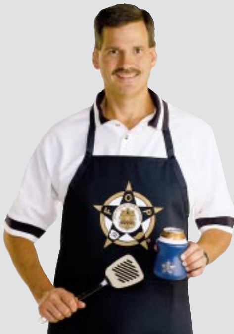
APRON - ITEM #6000 Full apron with two large front pockets and screen printed FOP logo. Many uses at home or the lodge. One size fits most. $11.00