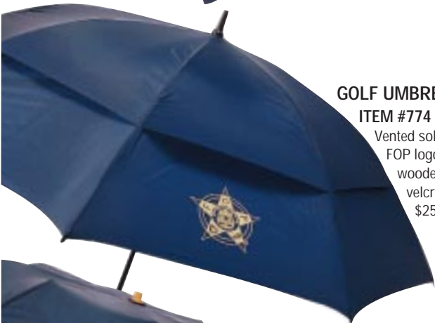
GOLF UMBRELLA ITEM #774

Vented solid navy with gold FOP logo. 62" spread with wooden handle and velcro strap closure. $25.00