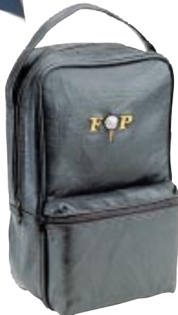
GOLF SHOE BAG ITEM #780

Nice gift for the golfer, but also good for the traveler. This bag will keep any shoe clean and protected from items surrounding it. Available in black. $16.00