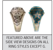
FEATURED ABOVE ARE THE SIDE VIEW DESIGNS ON ALL RING STYLES EXCEPT G.