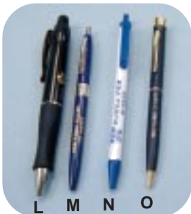
L M N O

O. GARLAND PEN WITH FOP LOGO ITEM #629 Deluxe writing pen manufactured by Garland. Head of pen displays color FOP logo. Black ink only. $13.00