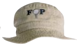
FOP FLOP HAT - ITEM #1060 100% cotton flop hat. Perfect to shade your eyes while teeing off at the 19th hole. $13.00