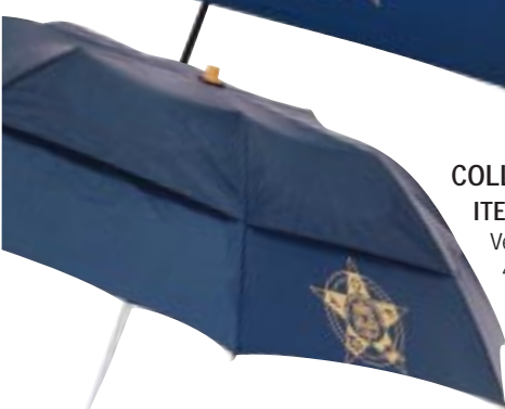
COLLAPSIBLE GOLF UMBRELLA ITEM #774S

Vented solid navy with gold FOP logo. 62" spread with wooden handle and velcro strap closure. $25.00