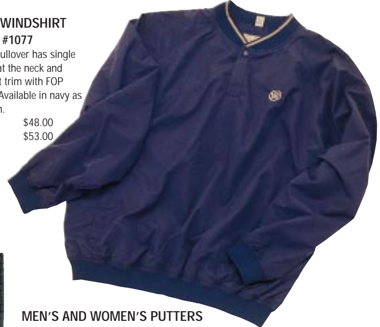
FOP WINDSHIRT ITEM #1077

Vented solid navy with gold FOP logo. 43" spread with wooden handle, auto opening and carrying case. $17.50