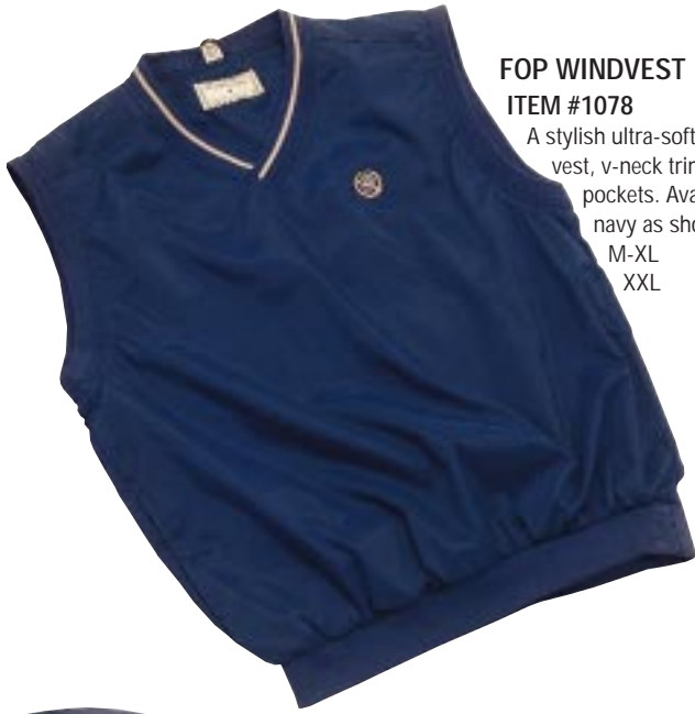
FOP WINDVEST ITEM #1078

A stylish ultra-soft polyester vest, v-neck trim with side pockets. Available in navy as shown.